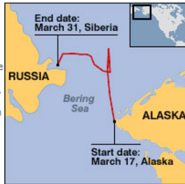
It took 14 days to cross the strait

Karl Bushby began his record breaking attempt to walk around the world in Chile in 1998 and is hoping to return to England by 2010.